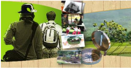
By Group of people behind the palace